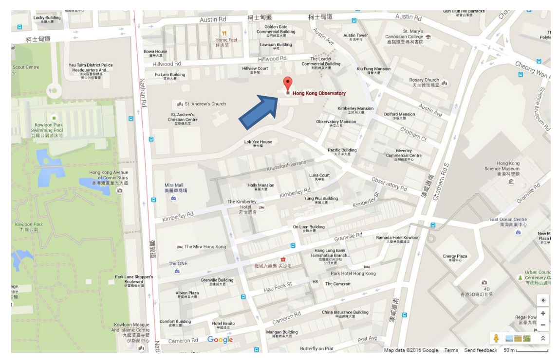
Map 1: Location of HKO